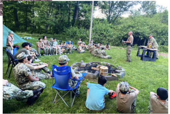
Below 2 photos: early meeting at new Bundy Division.