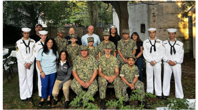
Barque Eagle supported the Columbus House picnic to raise funds for homeless vets (photos above and to left).