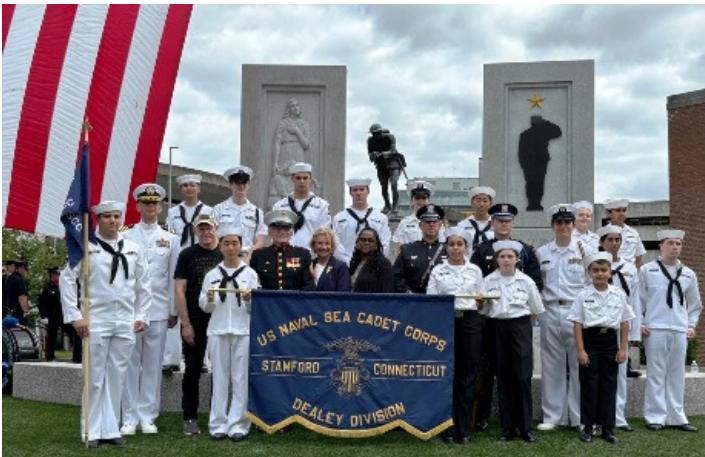
Dealey Division at Stamford Memorial day parade (above); at annual Flagship competition at Joint Base Cape Cod with trophies won (right above); and at graduation ceremony (right).