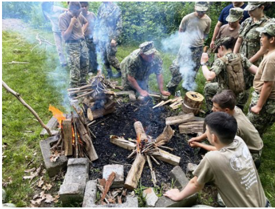
Above 4 photos: Barque Eagle field training exercise.