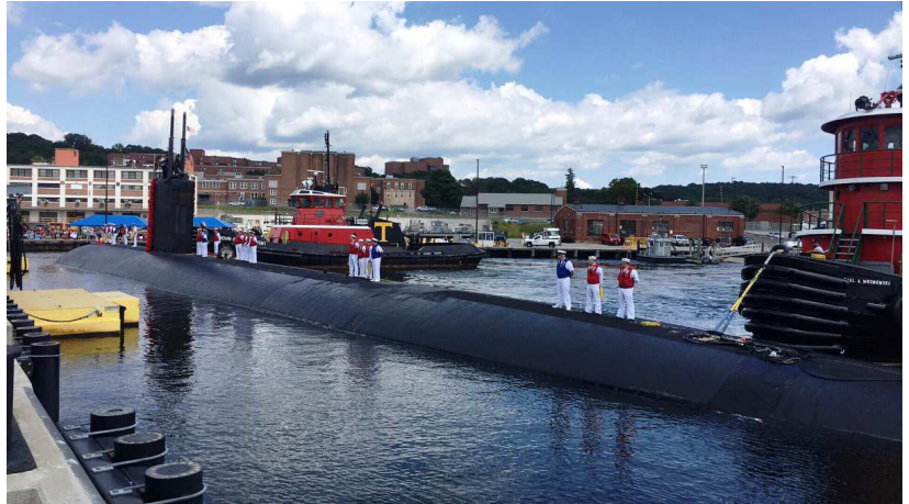
USS Hartford docking at Sub Base New London in 2019.

USS Hartford is one of forty-one active duty Los Angeles-class, nuclear powered, fast attack submarines. The sub has four torpedo tubes and twelve vertical missile launching cells. She was commissioned in December 1995 in Groton, and is the second warship to bear the name of our state's capital.