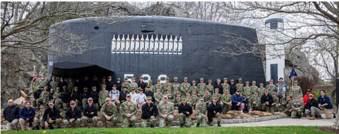
At left: Nautilus Division hosted out-of-state sea cadet units from Rhode Island (Falcon Div.) and New York (G. Washington Div.); over 100 cadets visited the Submarine Museum in Groton.