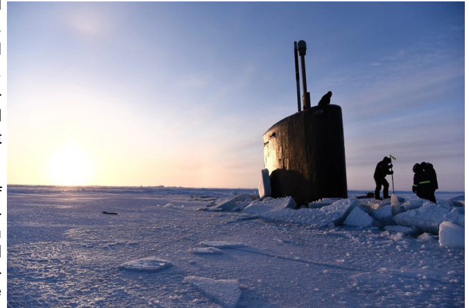
USS Hartford, on the surface through the ice in the arctic in 2018.