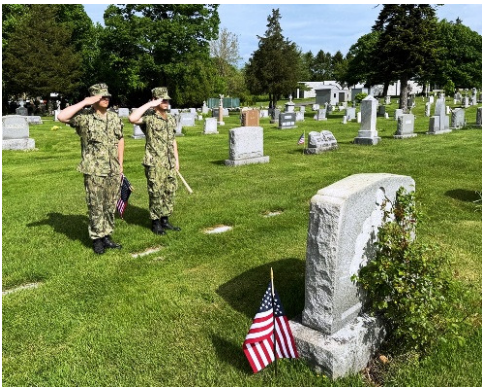
Dealey cadets placing cemetery flags.