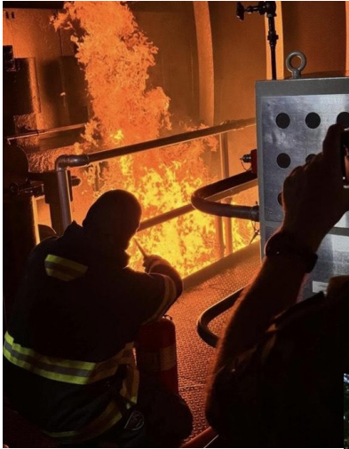
Cadets from Nautilus Division attended a Submarine Training Seminar in Groton, that included many aspects, two shown here: damage control/fire trainer (left) and navigation simulator (right).